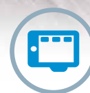
LCD SEGMENT DISPLAY