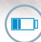
INTERNAL RECHARGEABLE BATTERY