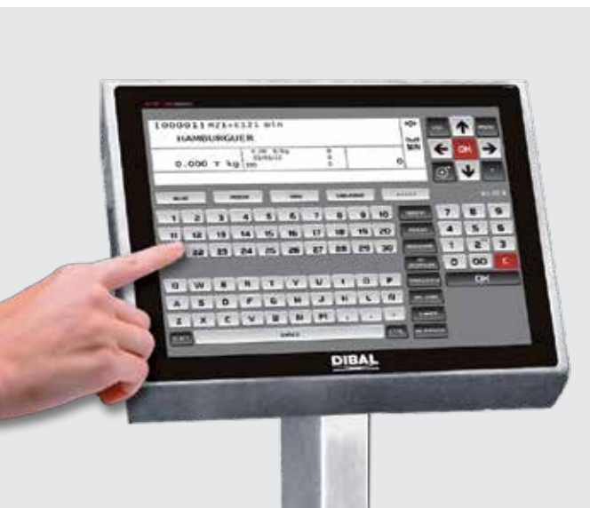
> Touch screen console