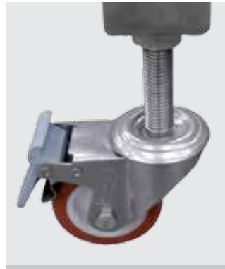
Ref: Contact us

To change the position or orientation of the products.