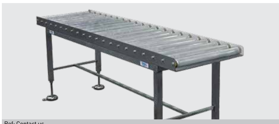
Ref: Contact us