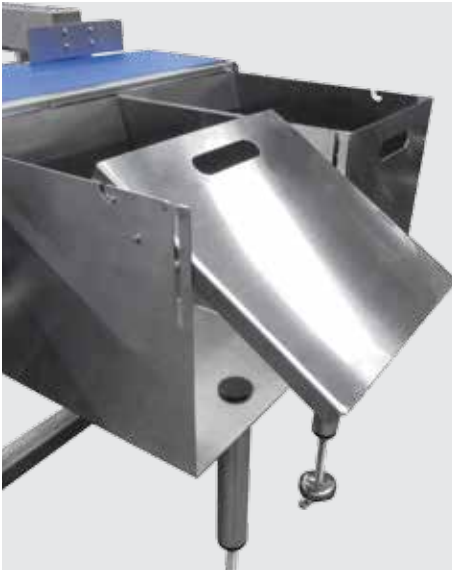
> Container for classified products