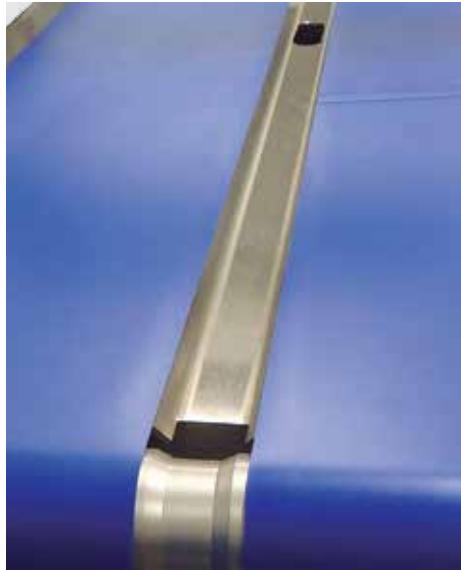
> Split belt