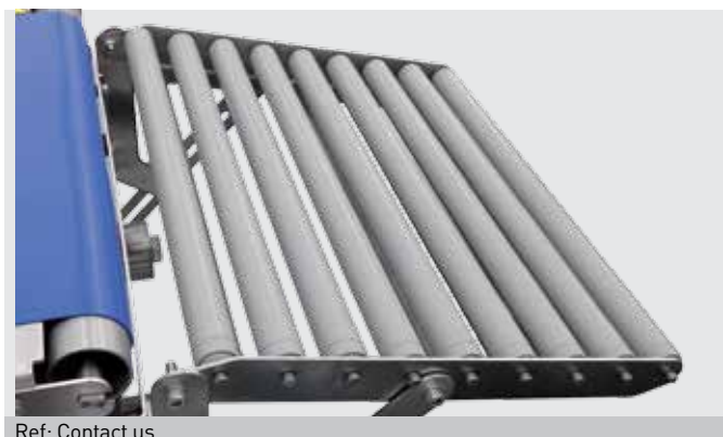
Ref: Contact us

To collect wrapped and/or labelled products.