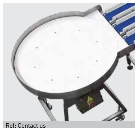
Ref: Contact us

Rollers conveyor for transporting or accumulating products.