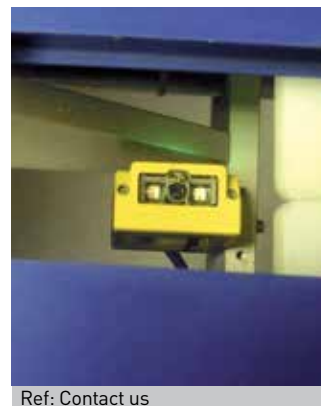
Ref: Contact us