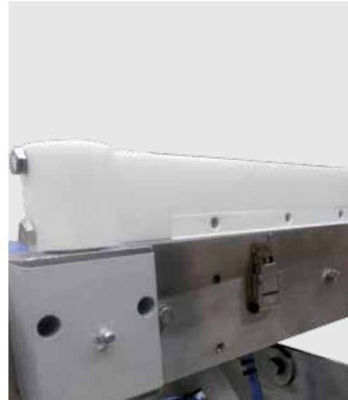
> Grading by rotating blade