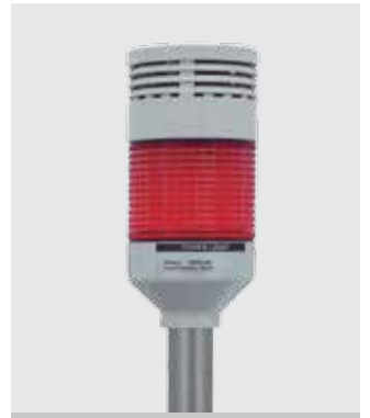
Ref: Contact us