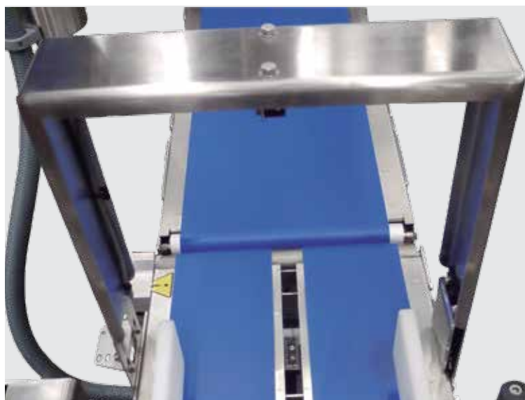
> Vertical detector on arch