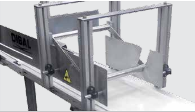
Ref: Contact us

To avoid external disturbances during the weighing process.