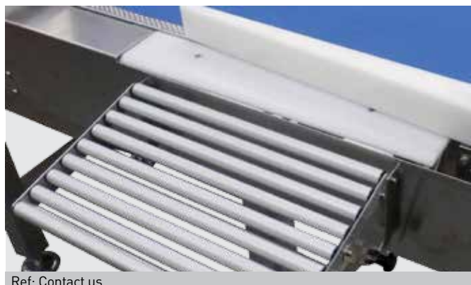
Ref: Contact us

Non-motorised PVC rollers for W280 mm conveyors.