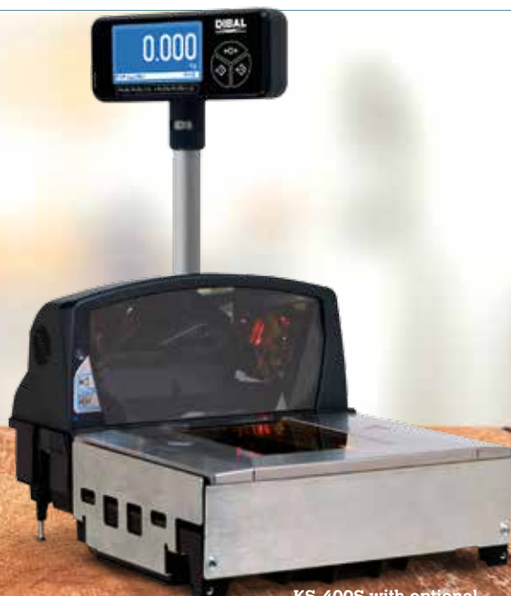
KS-400S with optional Honeywell Stratos MS2421 scanner (scanner not included)