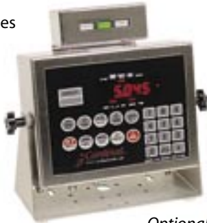
Optional Checkweigher Light Bar for Model 210